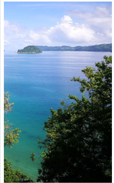
DAY 3: PACIFIC SHORELINE IN CUAJINIQUEL

We will pack most of our belongings this evening as well, in preparation for an early departure in the morning.