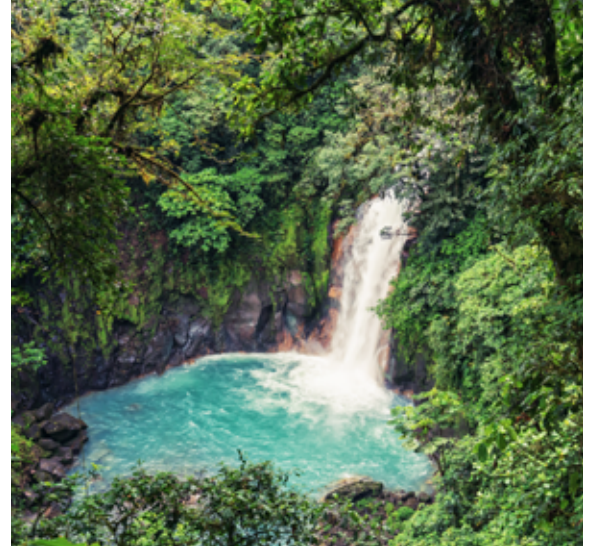
DAY 5: TENORIO NATIONAL PARK

Dinner is followed by a night hike or insect lighting depending on the group's interest.