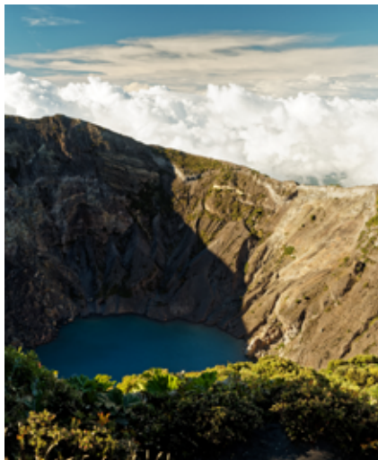
DAY 6: CENTRAL VOLCANIC RANGE