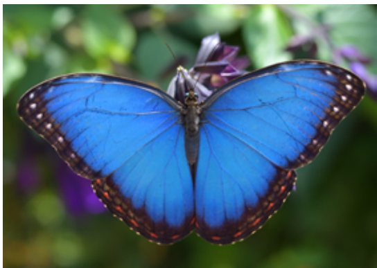
DAY 2: EL BOSQUE NUEVO

After breakfast, we will pack up and travel to El Bosque Nuevo farm site in Northern Guanacaste. Once we arrive, we will orient at the farm, unpack and enjoy a light lunch.