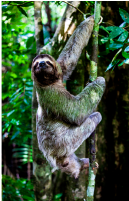
DAY 4: SLOTH SANCTUARY & NIGHTTIME ENCOUNTERS