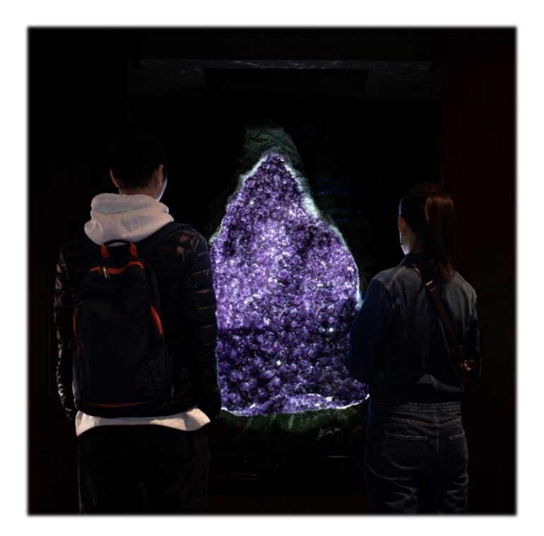
Plate Tectonics ( Two-hour class ) The idea of moving continents was first proposed a little over a century ago with Alfred Wegner's Theory of Continental Drift. The Theory of Plate Tectonics did not completely form until the late 1960s. This class will look at the clues scattered throughout the world and will end inside the Weiss Energy Hall, time permitting, where we will review the models and animations created to explain these theories.